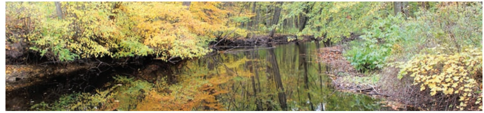
A peaceful view of the River Raisin on a property Legacy protects