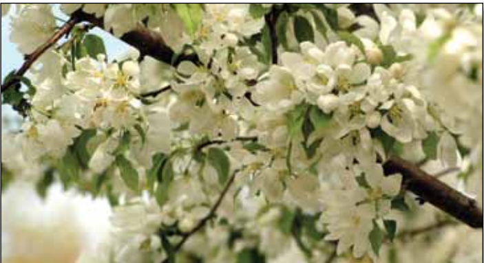
Spring blooms

If you have some great photos you would like to share with Legacy, give me a call.