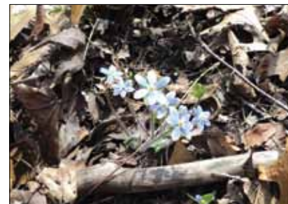
Hepatica: one of the rewards of stewardship!

Preserving land IS a lot like making jam...we preserve the qualities that are most important to be retained for future use. And similar to strawberries, if we leave land alone or just “let it go natural,” we may be letting our red, ripe strawberries turn to smelly, moldy mush—which is natural, but not useable for spreading on toast. In the case of natural areas, when we do not actively manage them, they march towards invasive monocultures. Systems that are dominated by invasive plants do not offer the same ecosystem services of water filtration, biodiversity support, erosion control, water cycling and habitat that native forests, wetlands, and prairies do.