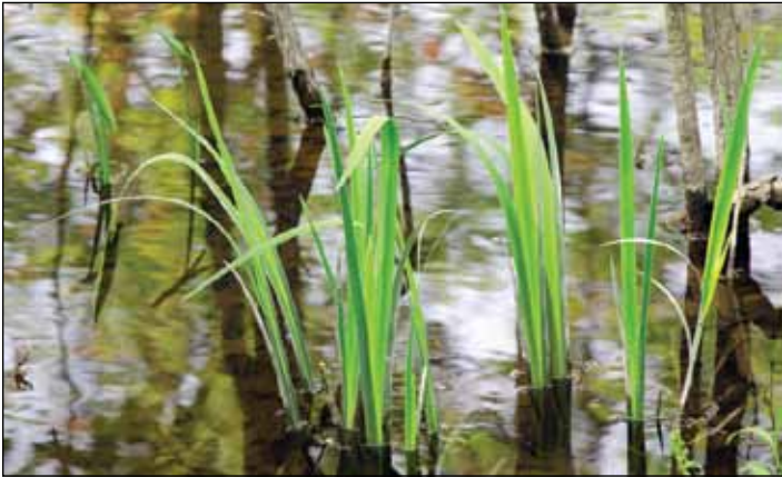
Manchester wetlands