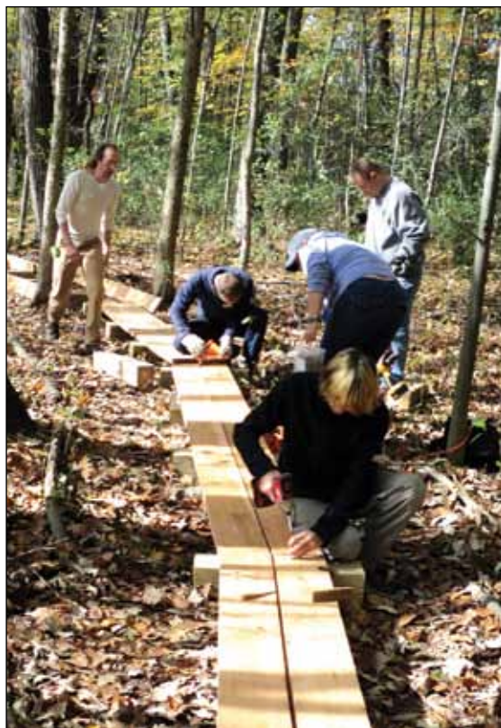
Volunteers assemble a simple boardwalk at the Johnson Preserve.

felt thank you to all of you who have contributed to our Stewardship Program. May we, together, leave a legacy of good stewardship!