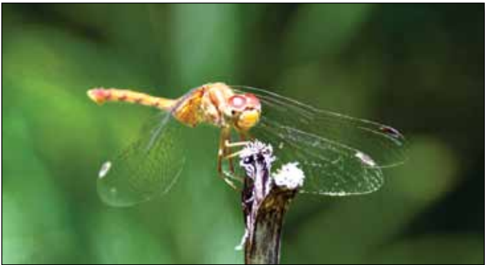
Dragonfly