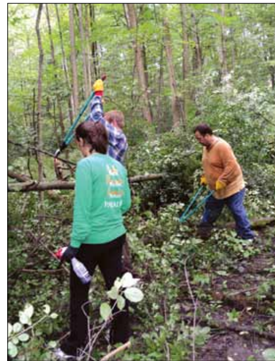
A group of volunteers from UM removes invasive shrubs from the Johnson Preserve.

On the ground, stewardship has to be supported by knowledge, good planning, tracking and follow-up. Legacy is part of the Heart of the Lakes Peer to Peer mentoring program designed to provide networking and education among stewardship peers in the region. We participate in the Stewardship