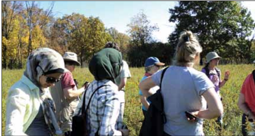
Hikers learn about Woodland Preserve during 5 Hikes in 5 Days last fall.

As Legacy works to protect important lands in Washtenaw and Jackson Counties, we also make plans and work towards responsible stewarding of that land to preserve it. What do these words mean, “protect” and “preserve?” What are we protecting the land from? Development? Is preserving land like preserving food? Like making