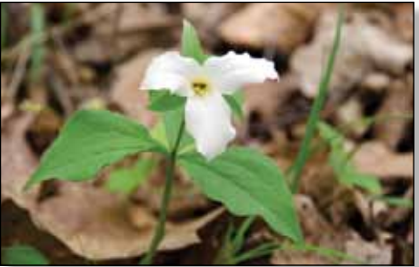
White trillium

Protecting land is a serious, complicated business. At Legacy board meetings, terms like “fee simple,” “FRPPs,” “PDRs,” and “perpetuity” are tossed about with abandon—not exactly the language of emotional connection. Nevertheless, it’s a story that needs to be told. That’s why Legacy’s board recently committed the organization to a three-