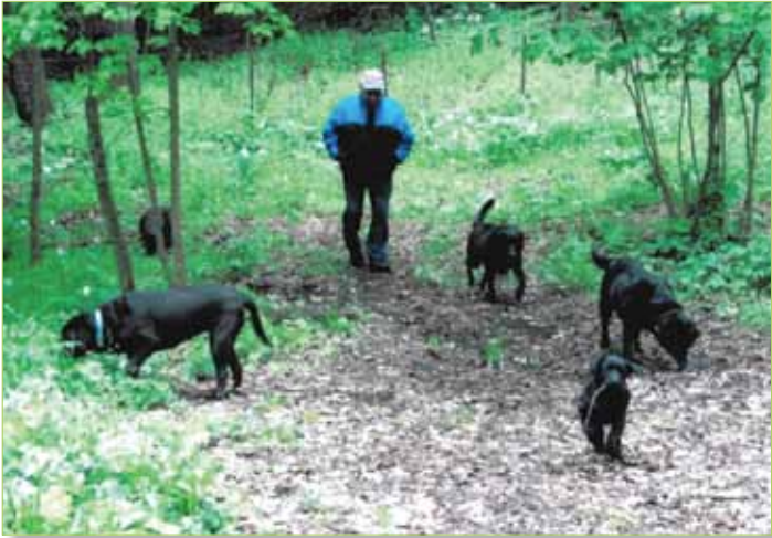
George Brewer with their Labrador Retrievers

We and our collection of Labrador Retrievers have come to love this special, peaceful place with its upland oak/hickory and lowland beech/maple woods, its areas of wetland, and its seven acres of meadow where bottled gentians and cardinal flowers grow. The dogs make sure that we get out for tramps through the woods at least twice a day, every day!