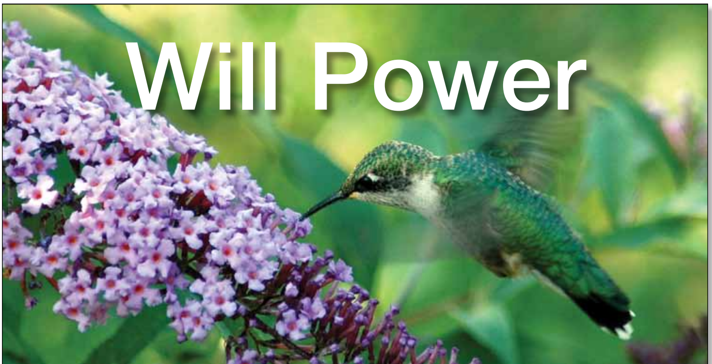
Hummingbird on the Nordblom-Michniewicz protected property

NONPROFIT ORG U.S. POSTAGE PAID ANN ARBOR, MI PERMIT No. 62