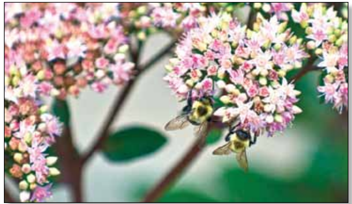
Bee Buddies

We are lucky to have this beautiful, invasive-free woodland preserve. Join us at this workday to plant native shrubs along the border to fight off invading buckthorn and improve privacy for our neighbors.