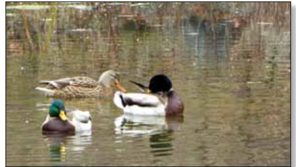
Ducks