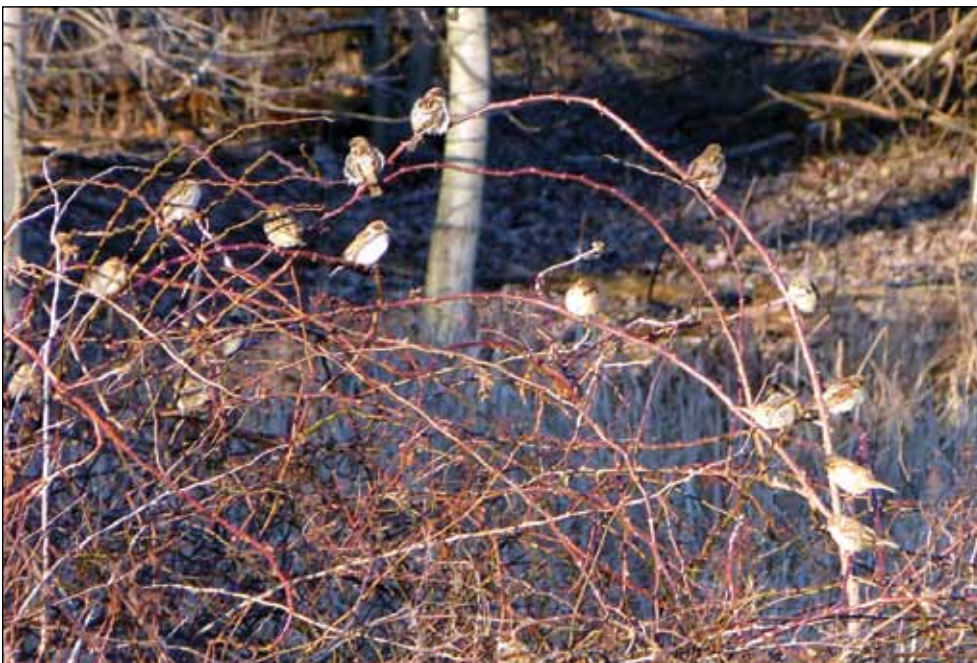
Sparrows in bush - Nordblom Property - Photograph by Barbara Michniewicz