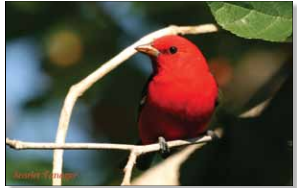
Scarlet Tanager