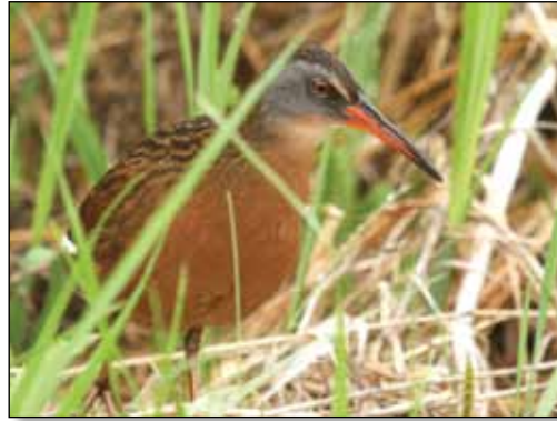
Virginia Rail

On average, 250 species of birds occur annually in the county. Of these, roughly a quarter are year-round residents and another quarter are summer residents and breeders here. A few species spend most of their time farther north and appear at this latitude only in winter. But the bulk of our bird life is transient, pouring through from the south enroute to northern breeding grounds, from upstate Michigan to the arctic tundra, in spring (late February through early June, but concentrated mainly in late