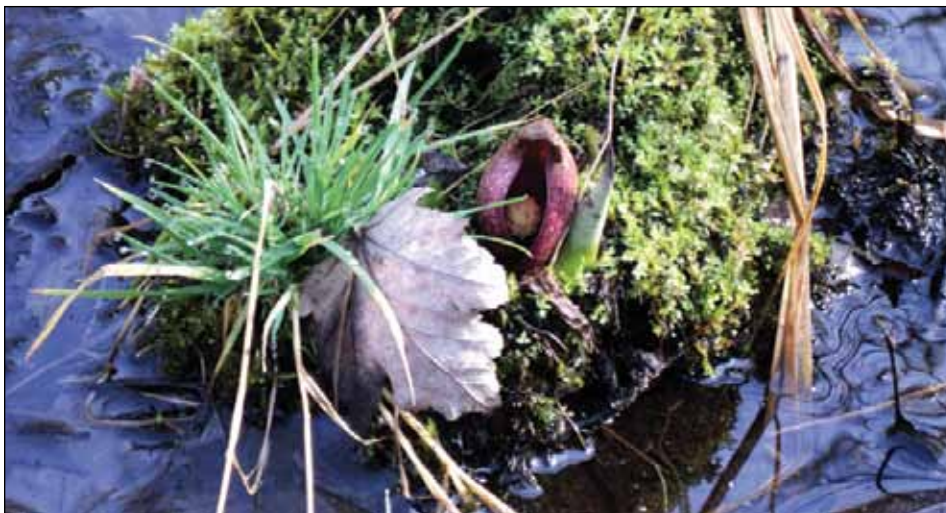
Skunk cabbage in bloom