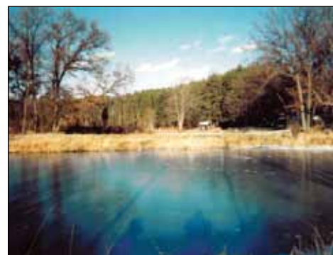
Little Pond on Farm